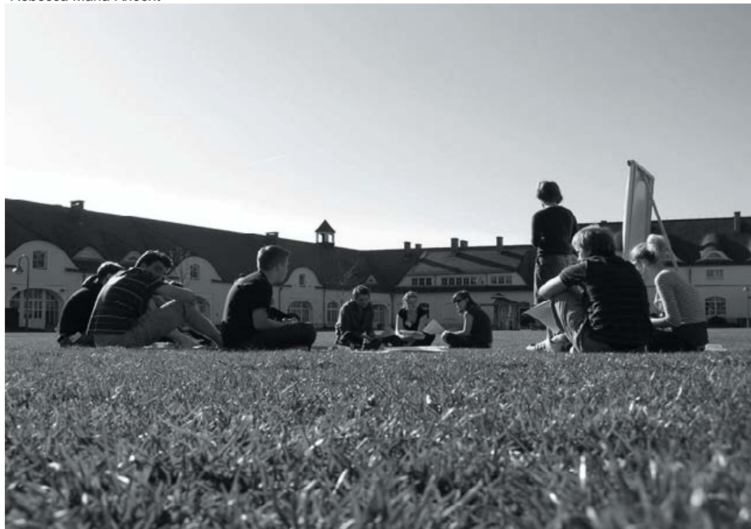
The groups doing rhetorical and legal training